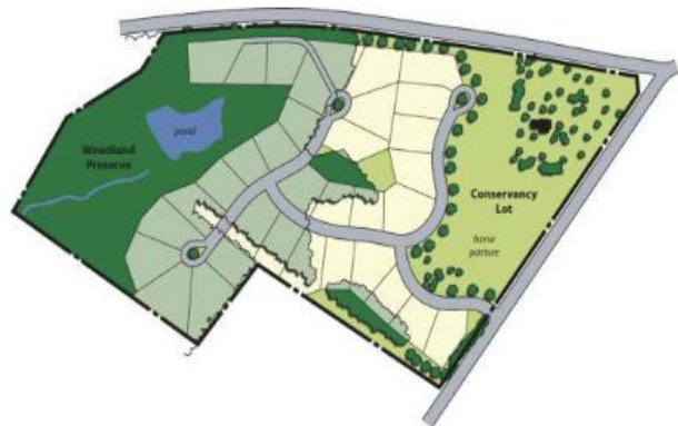
35 lot Open Space Design Subdivision